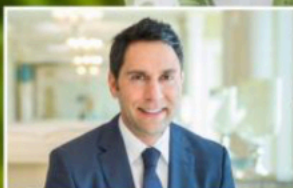
Tourism Promotion CEO of the Year & Excellence Award for Sales & Marketing Management - UAE