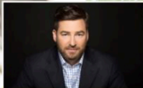
Distribution Grid CEO of the Year & Best Smart Grid Solutions Provider - North America