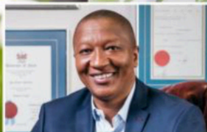
Best Real Estate CEO 2017 - South Africa